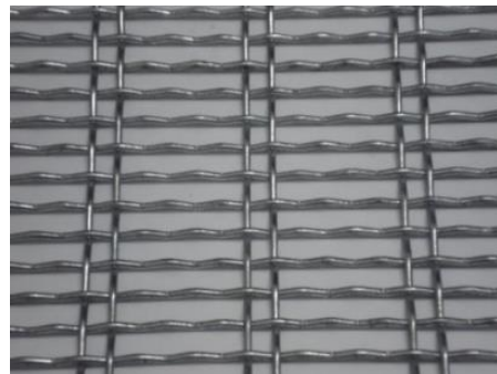
Double Wire Slot